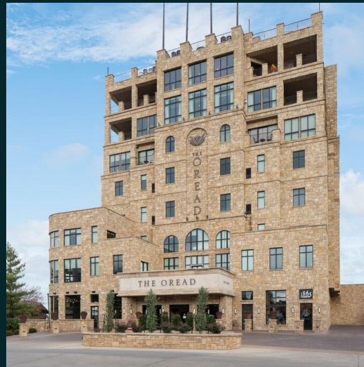
The Oread Lawrence Lawrence, KS

High quality, select service and extended stay hotels diversified by location, brand, and demand drivers.